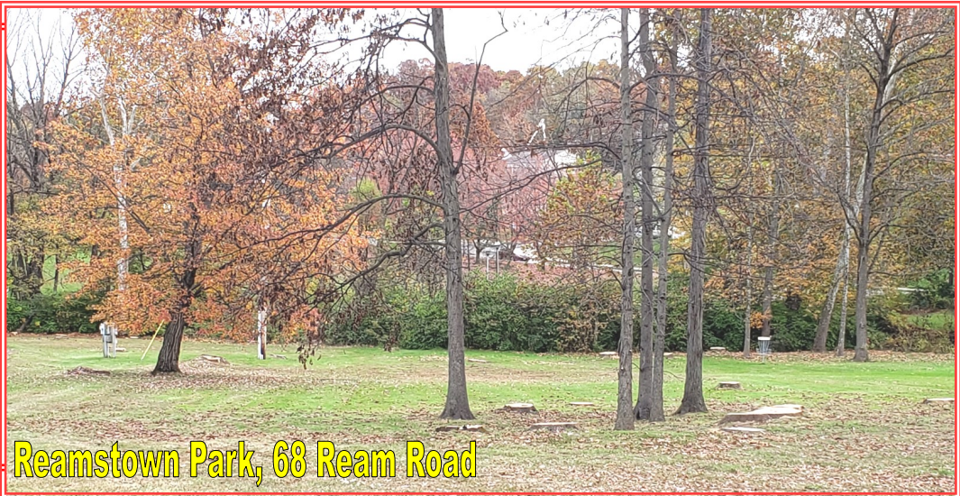
Reamstown Park, 68 Ream Road

Recently 21+ dead Ash trees were removed from the lower part of 68 Ream Road Park.