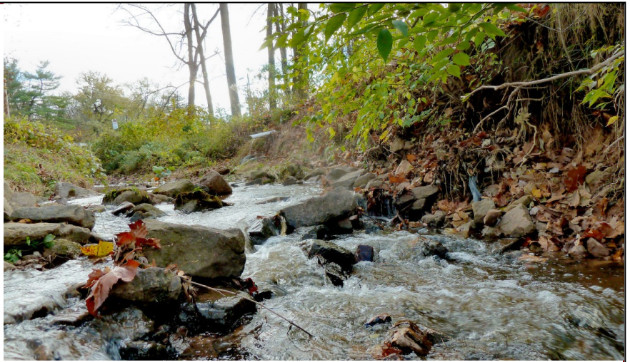
Here is a picture of the stream in the Reamstown Park in East Cocalico Township. An example of stream bank erosion.

The other projects that are planned include enhancements to existing stormwater detention basins. Detention basins designed and built fifteen or more years ago were primarily designed to reduce the level of major storm events and as a result do not focus on managing or improving the stormwater quality from smaller more frequent storm events. Newer basins and stormwater management facilities are still designed to reduce flooding and manage peak flows, but also are designed to encourage infiltration and improve the quality of the water leaving sites.