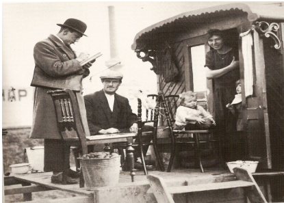
These people were counted, let's make sure you are.

After you receive your 2020 census form from the Census Bureau (in late 2019 or early 2020), you will have three methods to respond to the questionnaire: returning the paper copy, accessing the form online, or calling the Census Bureau. The census form will once again be short, consisting of about 10 questions that should take about 10 minutes to complete, and the goal remains the same: count everyone once and only once and in the right place . The census aims to record a "snapshot in time" so people should fill out the form based on where they live and sleep most of the time.