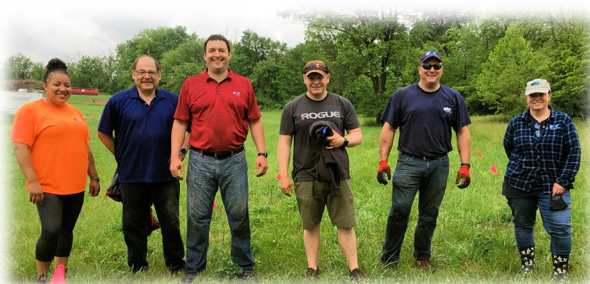
UGI volunteers planted 139 trees and shrubs.

In addition to the bank modifications, we also planted trees and shrubs in a 35-foot buffer zone along the stream. Volunteers from UGI did the planting. This “riparian buffer” helps protect the stream and filter pollutants from the stormwater runoff from around the stream. For this project, the estimated sediment reduction is 30,475 pounds per year.